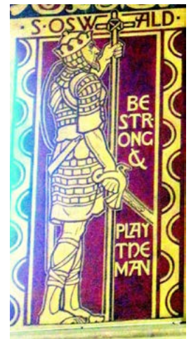
Sgraffito image of St Oswald in the Cathedral

St Oswald (604-642) is venerated as one of greatest national heroes of England, as a patriot who loved his people and kingdom, who led a holy life and became a martyr. The saint was born in the kingdom of Deira in northern England. His father became King of Bernicia, another kingdom in the north. Oswald was destined to unite these two kingdoms into one kingdom - Northumbria.