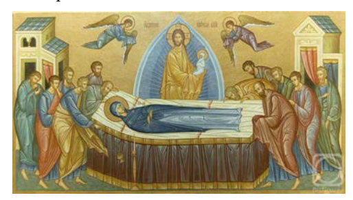
Icon of the Dormition of the Theotokos

As with the nativity of the Virgin and the feast of her entrance to the Temple, there are no biblical or historical sources for this feast. The Tradition of the Church is that Mary died as all people die, not "voluntarily" as her Son, but by the necessity of her mortal human nature which is indivisibly bound up with the corruption of this world.