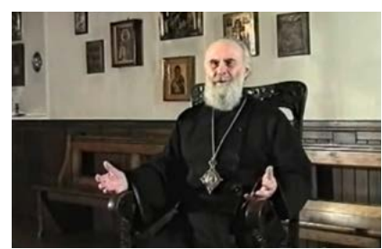
Metropolitan Anthony of Sourozh

It happens when our eyes are open, at a moment of purity of heart; because it is not only God Himself Whom the pure in heart will see; it is also the divine image, the light